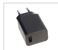
12 V charger