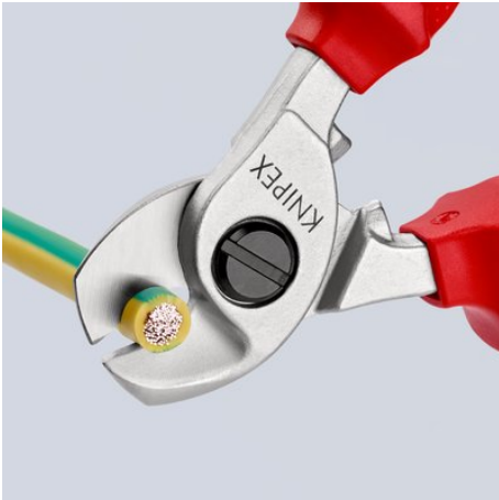
Cut performed with a Cable Shear: easy, clean cut without any deformation of the cable