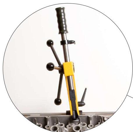
Adjustable stop collar